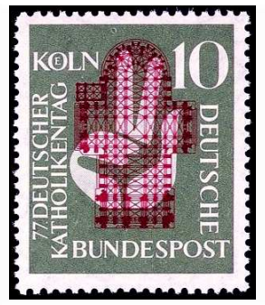
(Catholic Day Stamp (Germany) showing the floor plan of Germany's celebrated Cathedrals. Floor plan procured from "Dohme Gebauden," a book showing original floor plans).

Cathedrals were always built east and west, the high altar in the east (A) and the main entrance in the west, (B) and occasionally an entrance on the northern part. The inner plan was always in the form of a cross, (C to F and E to E), (C) the stem of the cross is called the nave. In gothic architecture little use was made of columns and piers externally, but were used extensively for the interior, slender shafts for ornament and massive for support.