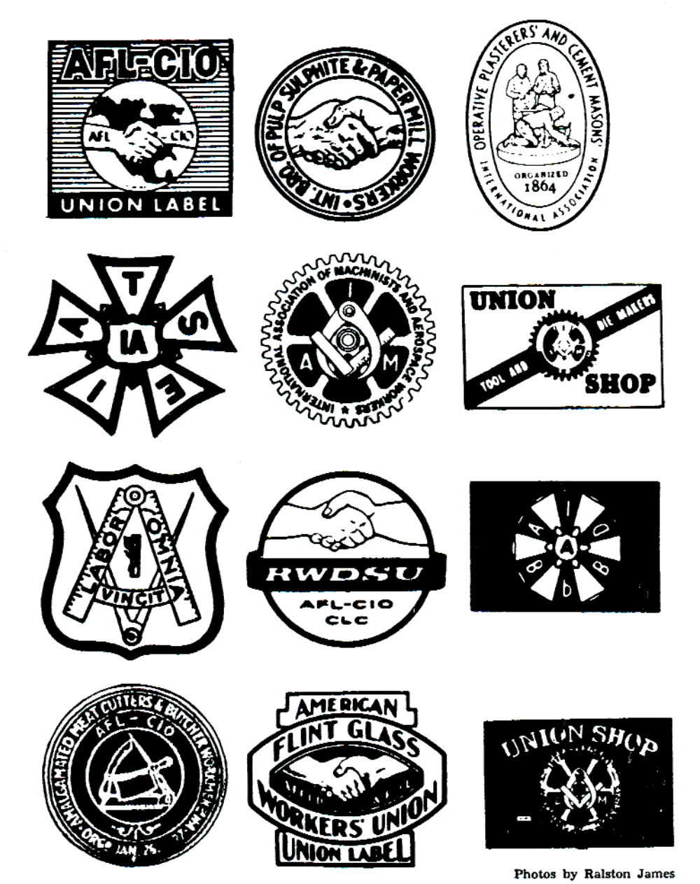
IDENTIFICATION OF UNION INSIGNIA