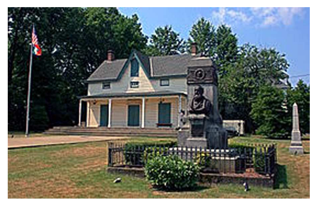
The Garibaldi-Meucci Museum in Rosebank, Staten Island, where Garibaldi resided during his time in New York.