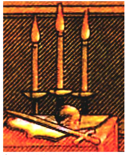
Stamp detail showing the sword and skull.