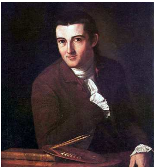
John Trumbull (1756–1843)