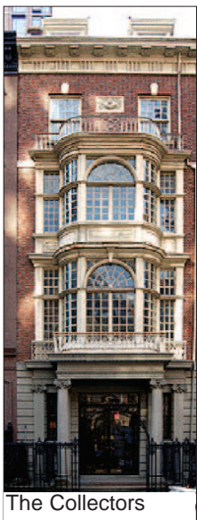
The Collectors Club, New York City.

In time, the Club outgrew various meeting rooms at the Grand Lodge of New York building on 23rd Street. As a result, in 1944 it asked the Collectors Club on 35th Street (seen on the left) for accommodations. This request was granted and meetings were held there through the courtesy of the Collectors Club, and continued to be held at this location up to the present time.