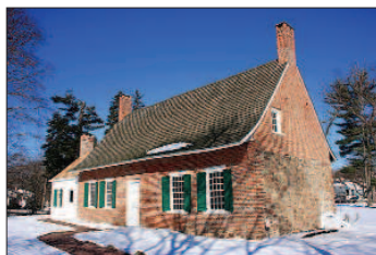
George Washington Masonic Shrine at Tappan, New York.

Late in 1938, the Club petitioned President Roosevelt to issue a commemorative stamp honoring the 150th anniversary of the inauguration of George Washington as the first President of the United States. The following year the stamp (shown above) was issued. When it became known that the stamp would be released, the Club prepared a special first day cover envelope as a Masonic souvenir. On the day of issue, April 30, 1939, the covers were sold to Club members all over the world for the sum of ten cents each. The proceeds of this initiative were contributed for the support the George Washington Masonic Shrine (old dwelling seen on the right) at Tappan, New York. The quaint little house was built in 1700 and it was often visited and occupied during the Revolutionary War by our distinguished Brother, George Washington. The Grand Lodge of New York maintains the shrine.