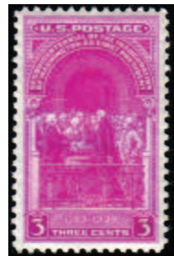
Washington Inauguration issue petitioned by the Club.