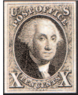
America's first two postage stamps.