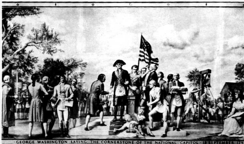
GEORGE WASHINGTON LAYING THE CORNERSTONE OF THE NATIONAL CAPITOL - 18 SEPTEMBER 1793

The George Washington Chapter of the Masonic Stamp Club prepared and Sponsored a 2-color commemorative cover, in connection with the Masonic ceremonies, commemorating the cornerstone laying of the original east side of the Capitol by President George Washington on September 18, 1793. The above illustration provided by the Buckingham Studio, from an original, was used as a cachet for this Masonic cover. The ceremony also marked the anniversary of the date in 1851 on which President Millard Fillmore laid the cornerstone of the Senate and House wings of the Capitol.