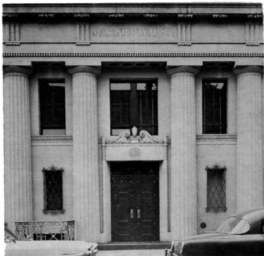
GERMAN MASONIC TEMPLE SILVER ANNIVERSARY WEEKEND HEADQUARTERS