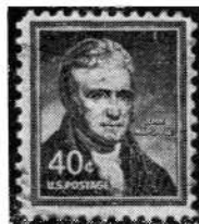
JOHN MARSHALL US #R179, 1050, 313, 263, 278.

WILLIAM PATERSON US #798. John Rutledge US #798.