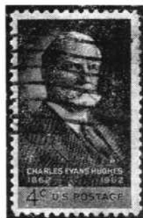
Charles Evans Hughes US #1195.