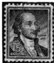
John Jay US #1046.