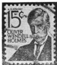
Oliver Wendell Holmes US #1288.