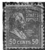
WILLIAM HOWARD TAFT US #831, 685, 687.