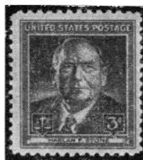
Harlan Fiske Stone US #965.

WILLIAM PATERSON US #798. John Rutledge US #798.