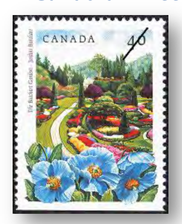
1991 Scott #1311

If you are one of the millions of tourists to visit Victoria British Columbia you may have had the chance to visit the nearby world famous Butchart Gardens.