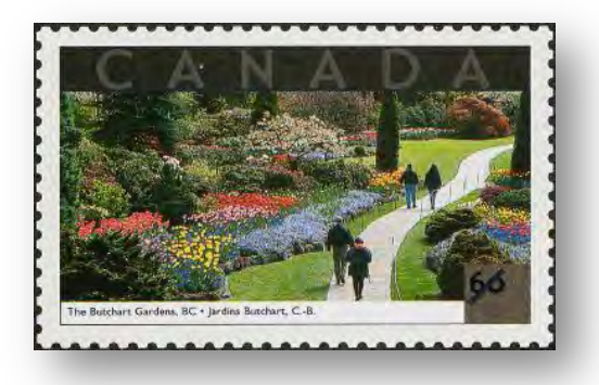
2001 Scott #1903a

been removed from the quarry leaving a bleak looking pit around the home.