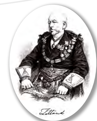
Can you identify these three men and what is their connection to Masonic Stamps? Their stories next in the next issue ot the Watermark.

fraternity has kept silent throughout its history and let people say whatever they want about this wonderful organization. But have you ever considered how many of the hundreds of thousands of good and decent men and their families could have been spared from persecution had we refuted the unrealistic, rhetoric that has been hurled at us by our critics?